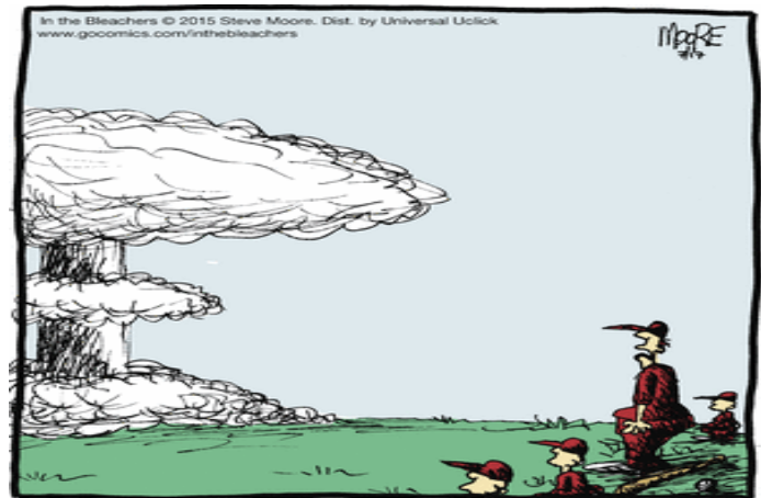
"Well, kids, now you know why I always tell you to wear clean underwear when you go out anywhere. You never know what's gonna happen."