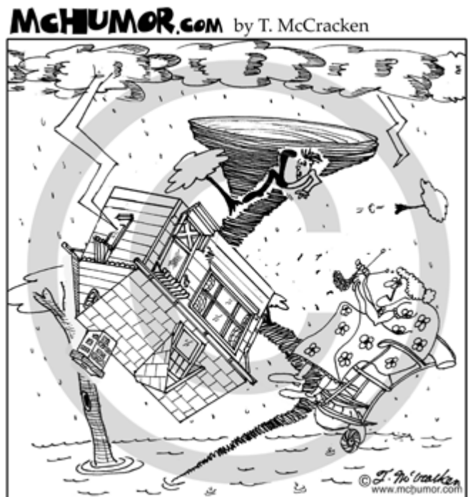
“Should we blame this on the church or the state?”

NEXT WEEK: Phil 2:12-30. We need to work out our faith with fear and trembling