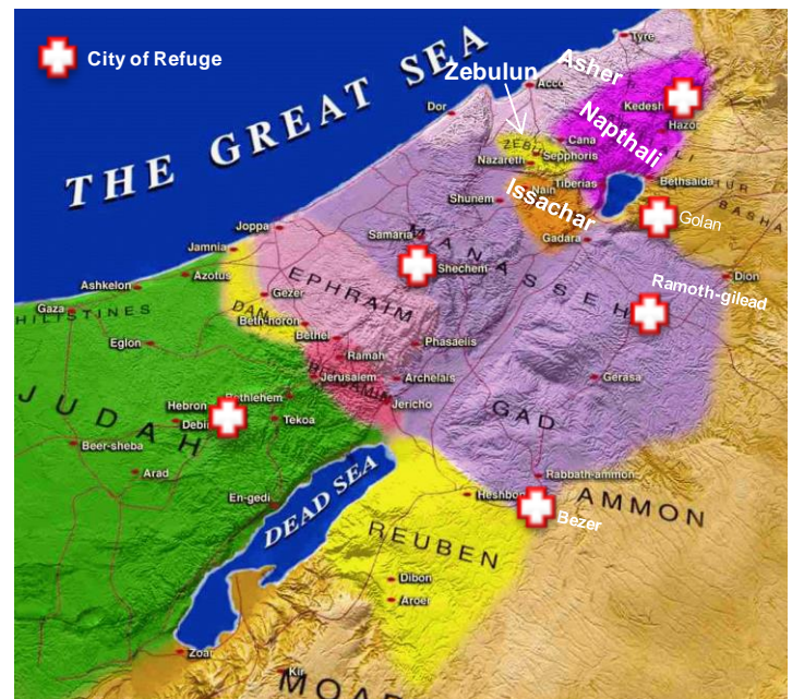
God established 6 cities of refuge for the new Jewish nation