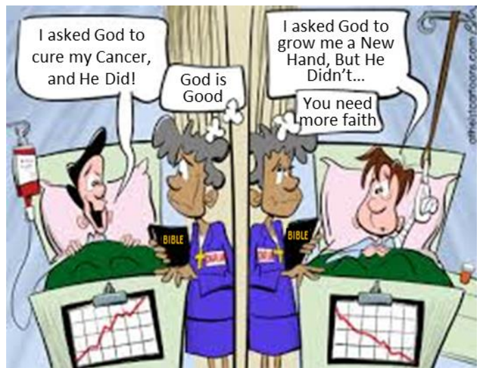
If God is not instantaneously and supernaturally healing the tough cases today, what makes us think He’s supernaturally healing easier cases? Bad Doctrine Brings False Hope and No Comfort.