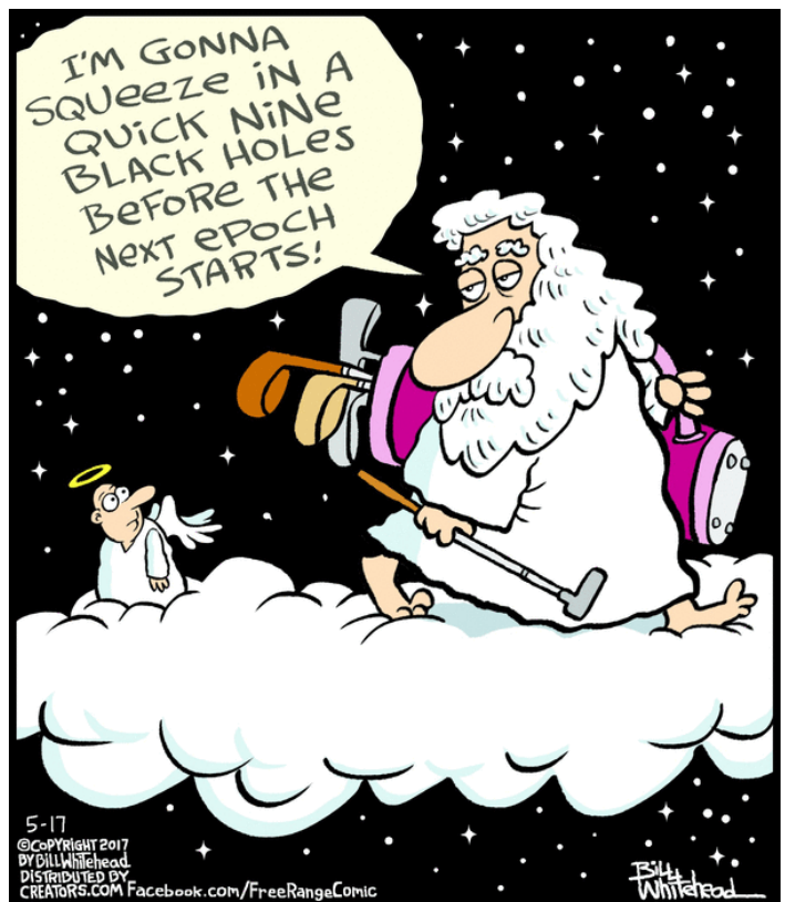
Why God Was Silent for 430 Years... Exodus 12:40

NEXT WEEK: Mark 1. The Gospel of Mark seems to be the 1st of the Gospels to be written. The other synoptic gospels (Matthew and Luke) seem to use Mark's narratives to develop some of their story lines. Mark emphasizes that Jesus was the Messiah, God in the flesh, as attested to by His varied miracles.