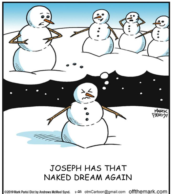
Not All of Joseph's Dreams Were Prophetic