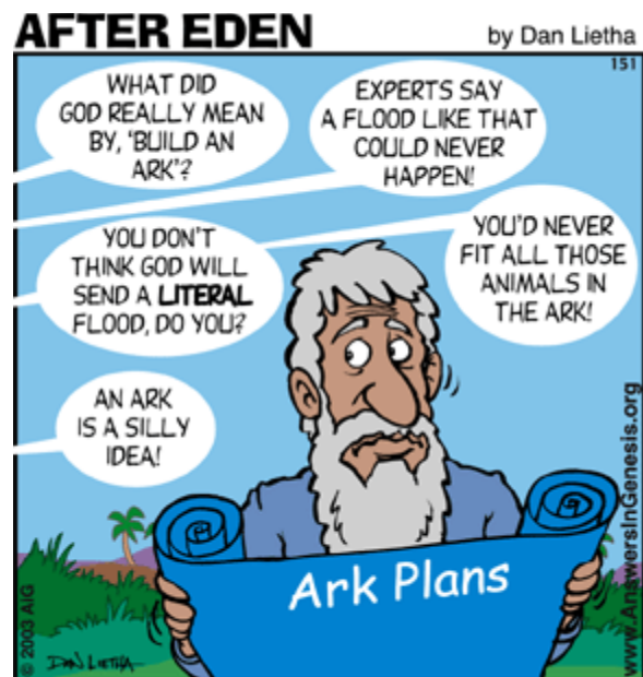
As it was in the days of Noah ...

NEXT WEEK: Genesis 11. Again, if God wanted to be vague about the age of the universe, here is a good place to do it. Instead, God was very meticulous to give us exact ages and years so we can tabulate the age the earth from the point of the earth's creation.