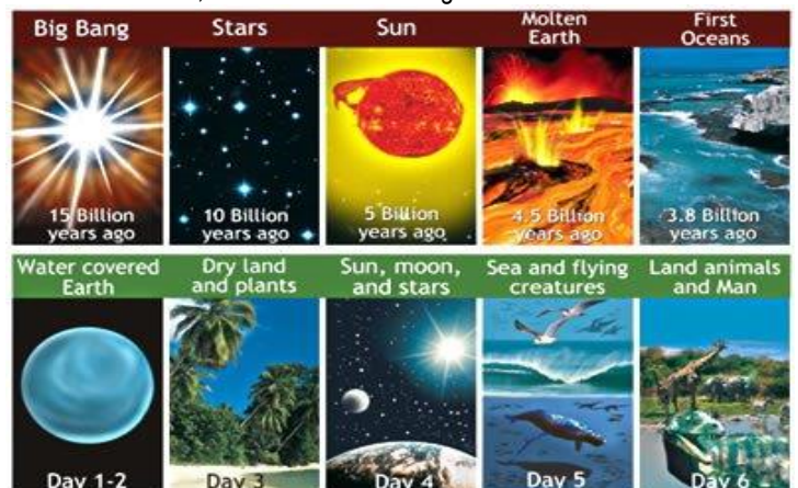
Evolution vs Creation

NEXT WEEK: Genesis 2. We are introduced to another perspective of creation, and more attention is given to Man and Woman