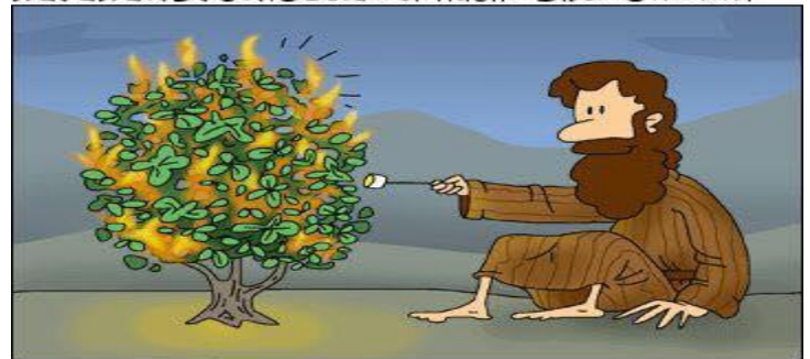
(See Acts 7:30-34)