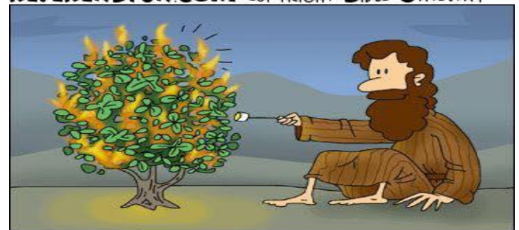
(See Acts 7:30-34)