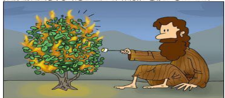
(See Acts 7:30-34)