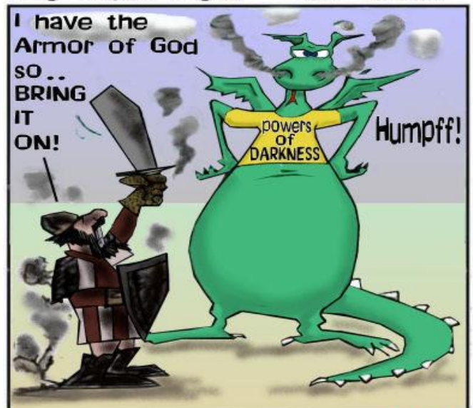
'FEARLESS' even when the heat is on. Eph 6:11