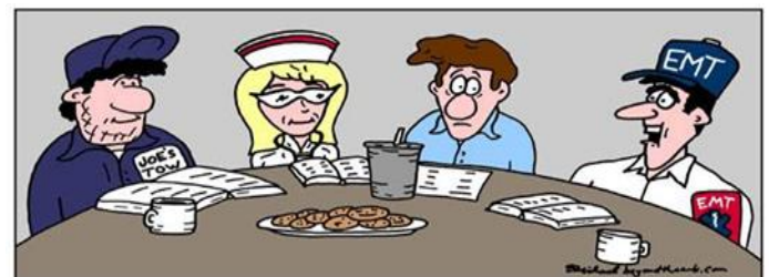
"We need someone to get run over by a car so we can all exercise our gifts."