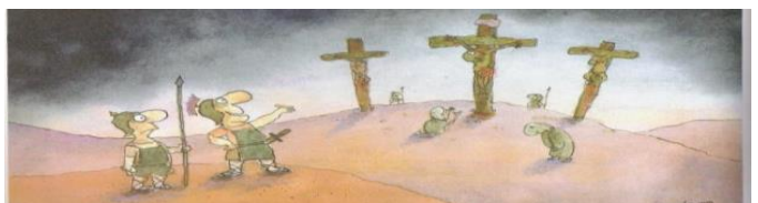
Look at this...you kill the leader & you nip the whole movement in the bud.

NEXT WEEK: Acts 10. An angel of God told Cornelius his prayers & money giving reached God's throne, so God wanted him to hear a special message so he could draw even closer to his Creator.