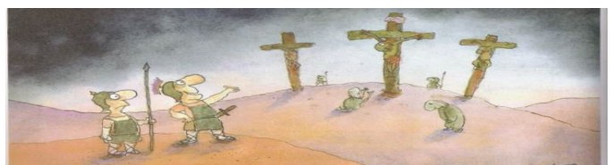
Look at this...you kill the leader & you nip the whole movement in the bud.

NEXT WEEK: Acts 10. An angel of God told Cornelius his prayers & money giving reached God's throne, so God wanted him to hear a special message so he could draw even closer to his Creator.