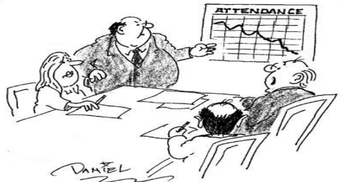
PREACHER, IF THINGS DON'T PICK UP PRETTY SOON, WE'RE GOING TO HAVE TO PRAY ABOUT IT

NEXT WEEK: Acts 7. The first church martyr, Stephen, is a man full of faith and of the Holy Spirit. God is not partial to anyone, so what keeps us from being full of faith and of the Holy Spirit?