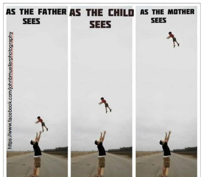
For good reasons, and by design, we all have different perspectives on things

NEXT WEEK: 1Timothy 3-4. Paul stipulates the qualifications required for church elders, deacons, and their wives; and he stresses the need to "pay close attention" to doctrine so people can be saved, both from Hell and from deception