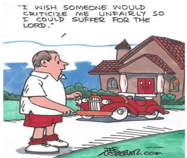
American Christians have got it good right now! So, while it is day, let us serve fervently.

NEXT WEEK: 1Peter 3:1-12. Wives are to be submissive to their husbands and a husband needs to be understanding of his wife's needs.