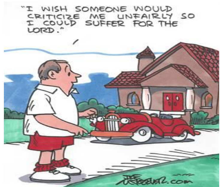
American Christians have got it good!

NEXT WEEK: 1Peter 3:1-12. Wives are to be submissive to their husbands and a husband needs to be understanding of his wife’s needs.