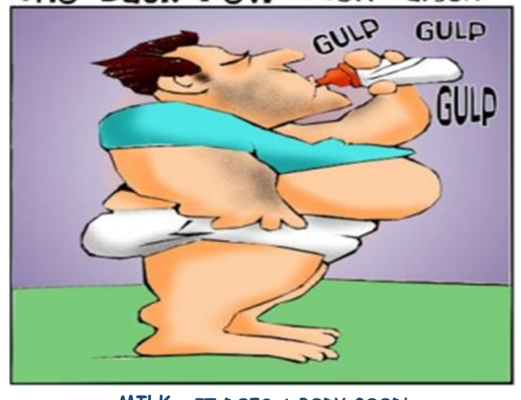
MILK - IT DOES A BODY GOOD!

But anyone who lives on milk is still an infant (Heb 5:13)