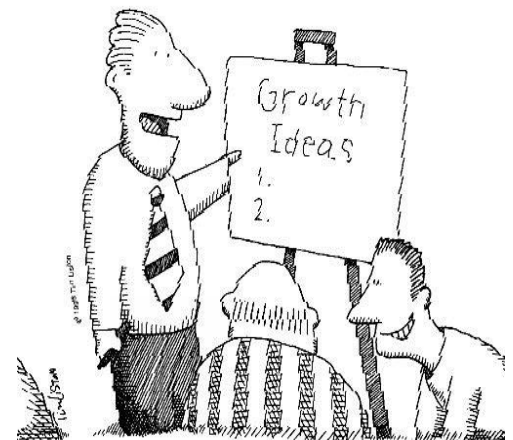
"Besides calling every Sunday 'Easter', does anyone else have ideas for improving church attendance?"

Again, we need to ask tough questions to identify what is broke and then fix things!