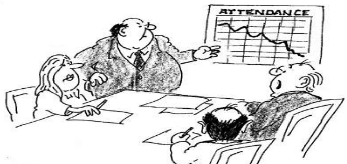
PREACHER, IF THINGS DON'T PICK UP PRETTY SOON, WE'RE GOING TO HAVE TO PRAY ABOUT IT