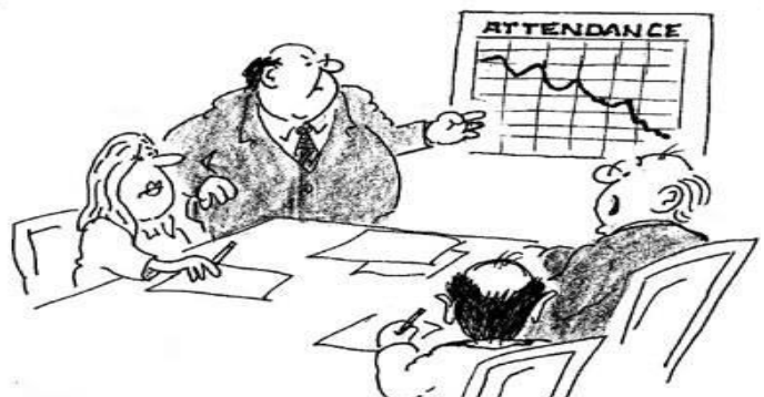
PREACHER, IF THINGS DON'T PICK UP PRETTY SOON, WE'RE GOING TO HAVE TO PRAY ABOUT IT