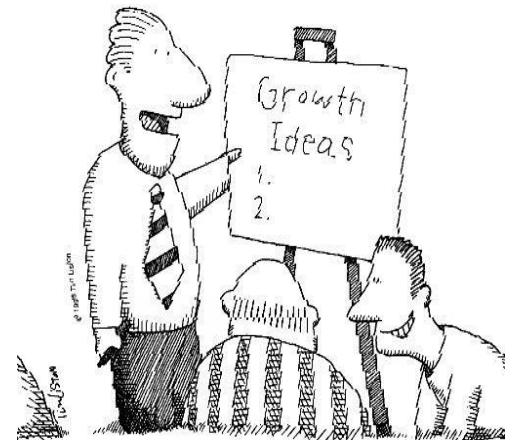
"Besides calling every Sunday 'Easter', does anyone else have ideas for improving church attendance?"

Again, we need to ask tough questions to identify what is broke and then fix things!