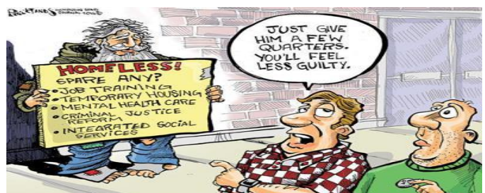
Remember: Scripture says to “Prove All Things” 1Thes 5:21