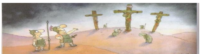
Look at this...you kill the leader & you nip the whole movement in the bud.

NEXT WEEK: Acts 10. An angel of God told Cornelius his prayers & money giving reached God's throne, so God wanted him to hear a special message so he could draw even closer to his Creator.