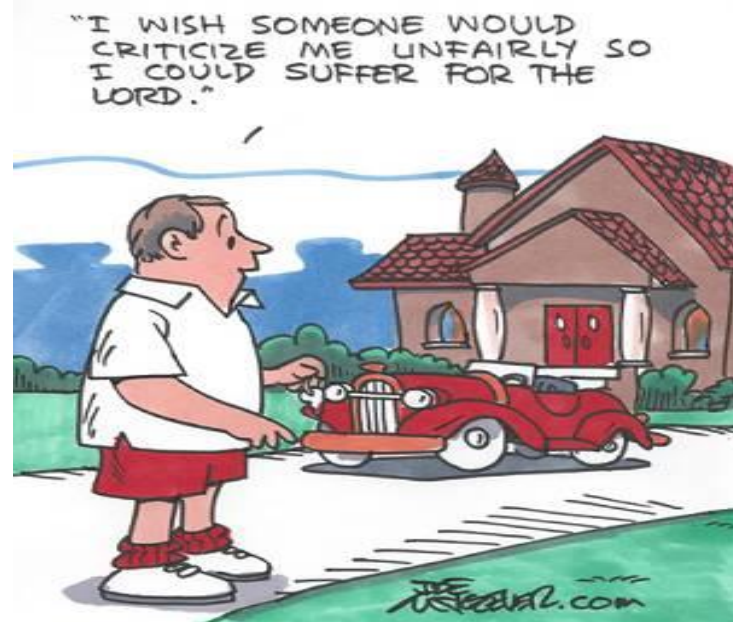
American Christians have got it good!

NEXT WEEK: 1Peter 3:1-12. Wives are to be submissive to their husbands and a husband needs to be understanding of his wife’s needs.