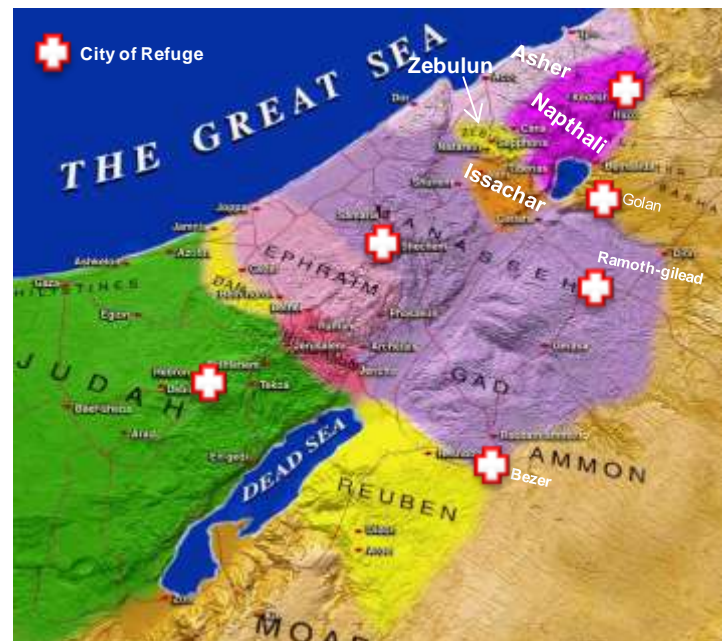
God established 6 cities of refuge for the new Jewish nation